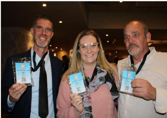
Attendees at the SME Growth Summit 2024 at Emperors Palace

+27 83 265 7654 | andrew@wcorp.co.za | www.cboconnect.co.za